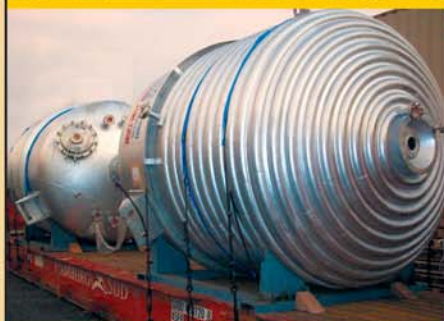
Custom Made Equipment