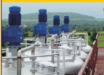
Food Grade Liquid Storage