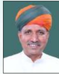
Sri Arjun Ram Meghwal