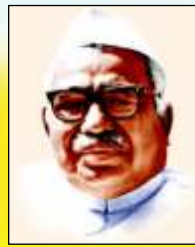
Sri Jagjivan Ram