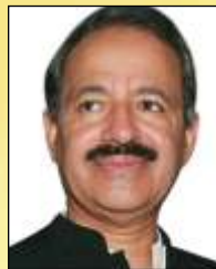
Sri Rashid Alvi