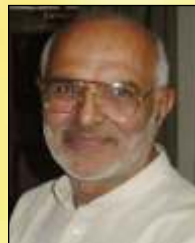
Sri Sahib Singh Verma