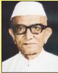
Sri Morarji Desai