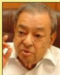
Sri Verghese Kurien